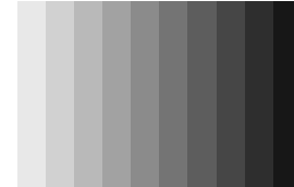
Figure 1 - A blend that shows shadestepping because it was created with too few steps.

One of the most common banding effects, shadestepping , occurs when too few steps are used in a blend (also called a graduated tint, a gradation, a fountain, a dégradé, or a vignette.) The result is a gradation that does not blend smoothly from one step to the next (see Figure 1). This effect may also be termed posterization . Users often mistake this type of banding as a problem with their imagesetter, when in fact, if the gradation is created with certain guidelines in mind, then no shadestepping will appear.